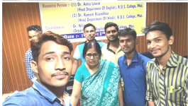
Workshop organized in the language lab